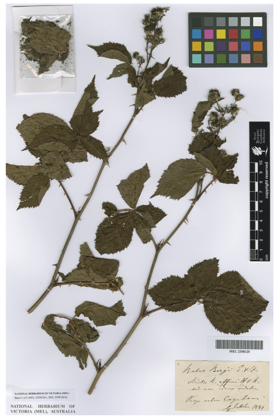
Figure 3. A specimen of Rubus bergii , collected by Ecklon (MEL 2358125)