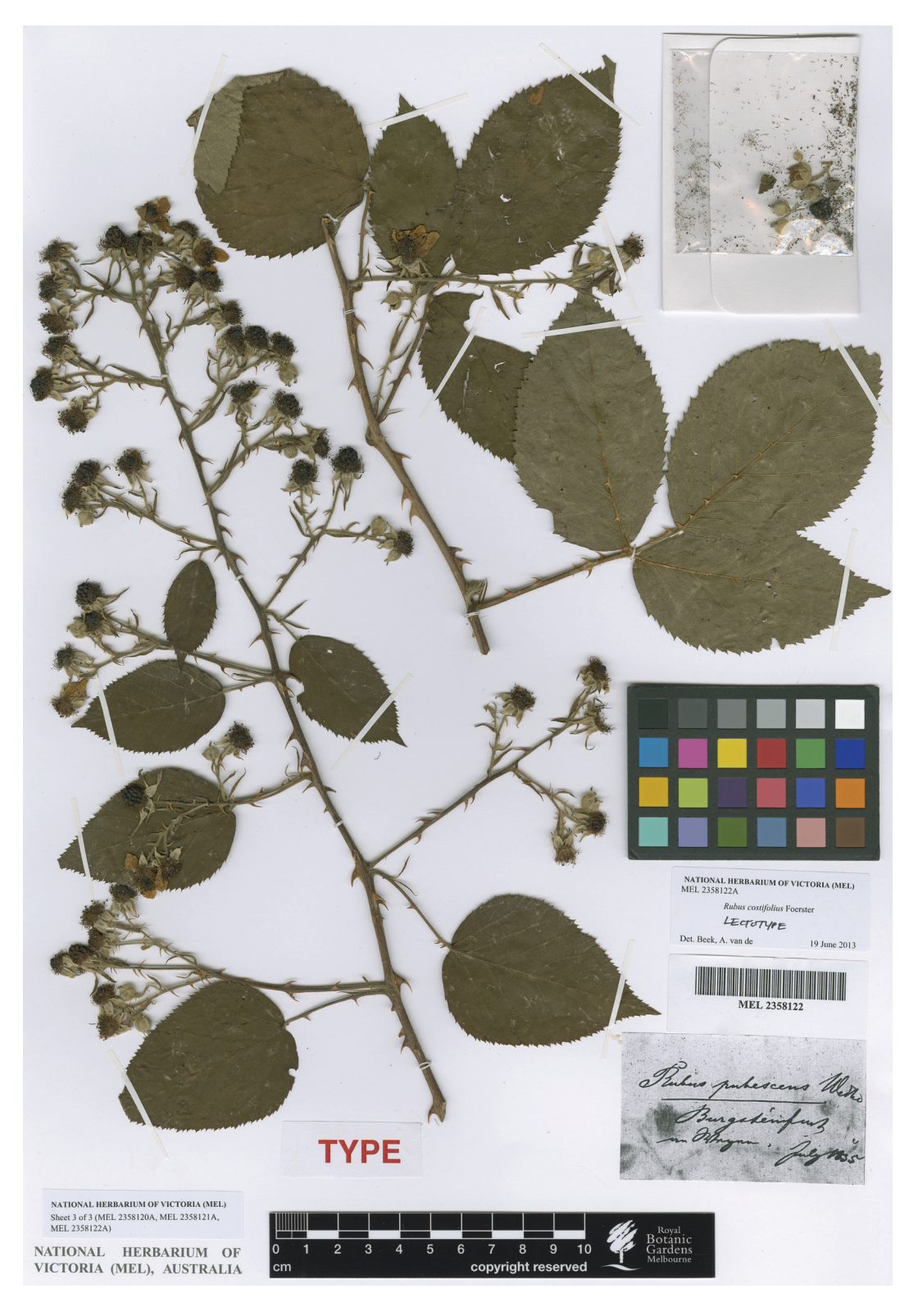
Figure 1. Part of the lectotype of Rubus costifolius (MEL 2358122)