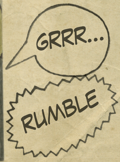
IT GURGLES, GRUMBLES, GROWLS AND POPS, THEN, JUST AS SUDDENLY, IT STOPS!