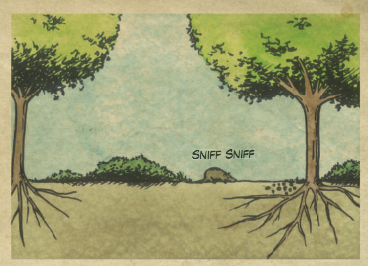
LATER ON THAT VERY DAY, BANDI COMES IN SEARCH OF PREY...