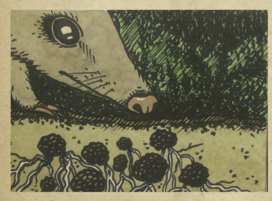
BANDI'S NOSE HAS GOT A HUNCH THAT HE'LL HAVE FUNGI FOR HIS LUNCH!