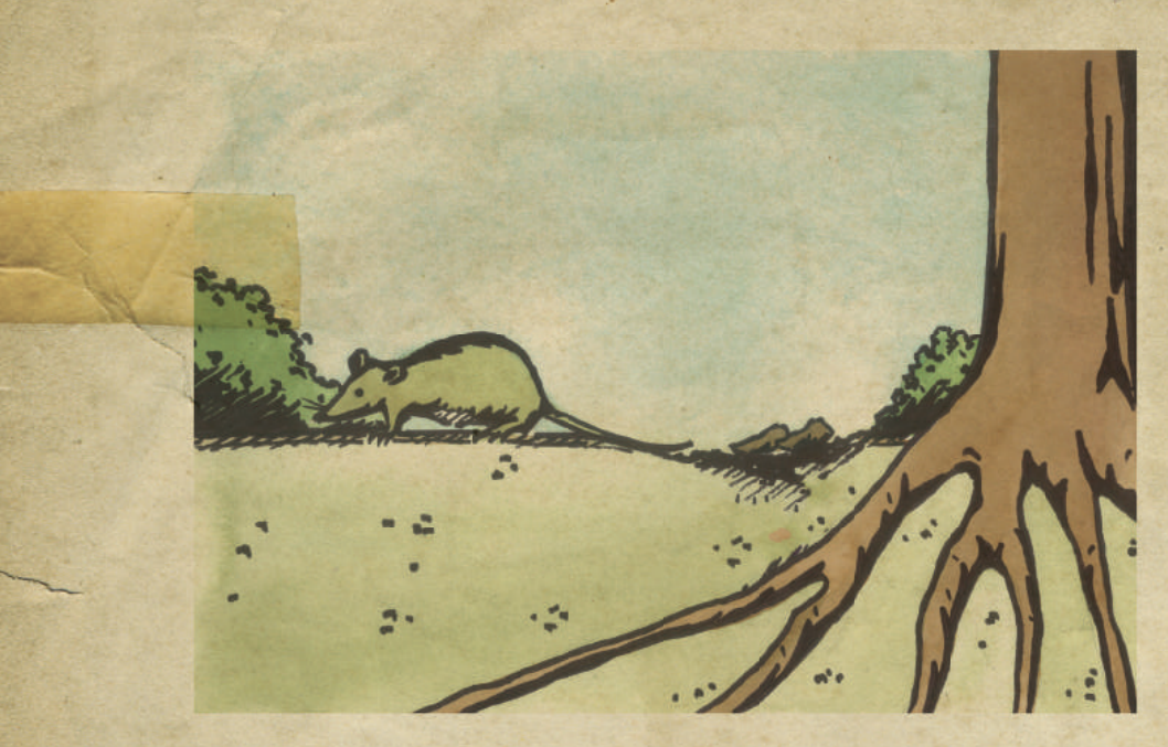
RELIEVED THAT NOW HE FEELS OKAY, HE SCAMPERS OFF ABOUT HIS DAY... BUT WHERE HE SLEPT, THERE ON THE GROUND, HE'S LEFT SOMETHING TO BE FOUND...