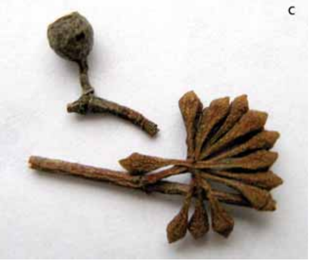
Figure 2 . Eucalyptus ornans a) mallees prior to 2007 flooding of the Avon River (Rule, 13/9/06); b) canopy of immature mallee (Rule, 13/9/06); c) buds and fruits ( Rule 3805 )