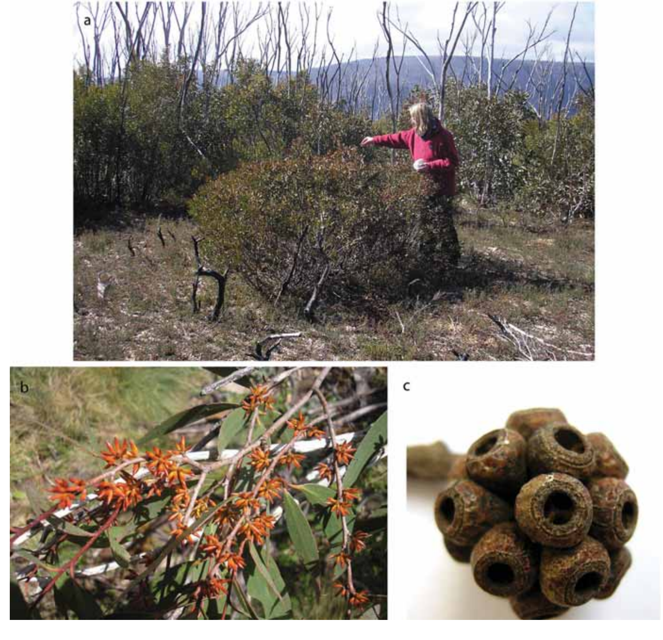
Figure 3. Eucalyptus forresterae a) regenerating mallee at Brumby Point post 2003 fires (Molyneux, 15/11/08); b) buds and adult leaves at Brumby Point (Molyneux, 15/11/08); c) fruits from type locality (Rule, 6/2/10)

Associated species: Eucalyptus sp. aff. dives Schauer, E. elaeophloia Chappill, Crisp & Prober, E. glaucescens Maiden & Blakely, E. kybeanensis Maiden & Cambage, E. mannifera Mudie, E. pauciflora Sieber ex Sprengel subsp. niphophila (Maiden & Blakely) L.A.S.Johnson & Blaxell, E. perriniana F.Muell. ex Rodway, E. rubida H.Deane & Maiden, E. viminalis Labill. subsp. viminalis and Hakea asperma Molyneux & Forrester have been