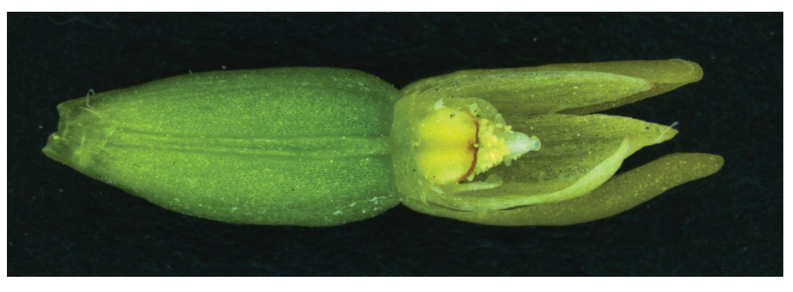
Figure 2. Prasophyllum abblittiorum with dorsal sepal removed showing the unornamented petaloid labellum (behind the column) and fragmenting pollinia.

plant characters not collected in the field, we aggregate the much smaller number of lab measurements from fresh, spirit and pressed specimens, and provide minimum and maximum measured values, unless indicated explicitly.