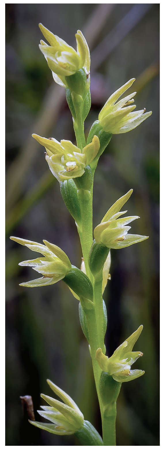
Figure 1. Prasophyllum abblittiorum