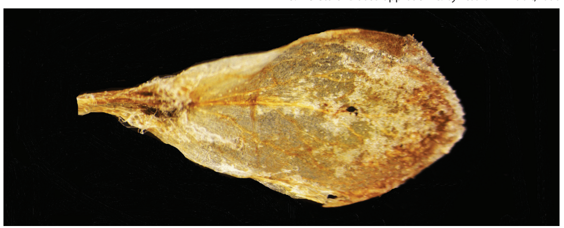
Figure 2. Craspedia sylvestris Capitular bract (from MEL 2045414).

Notes: The ovate to broadly ovate, narrowly-margined bracts of the individual capitula are distinctive and contrast to those of other species of subalpine to alpine Craspedia of similar habit (in particular C. aurantia , C. crocata which have broad hyaline margins, often widely dilated in the proximal half to the extent that the bract is somewhat 3-lobed. From C. aurantia it is further distinguished by the long 'petiolate' leaves and from C. crocata (which is generally a species of higher mountains in Victoria) by the overall more robust habit, broader leaves and bracts and proportionately larger inflorescences. Some 'shade' forms of C. variabilis J.Everett & Doust approach C. sylvestris in habit, but