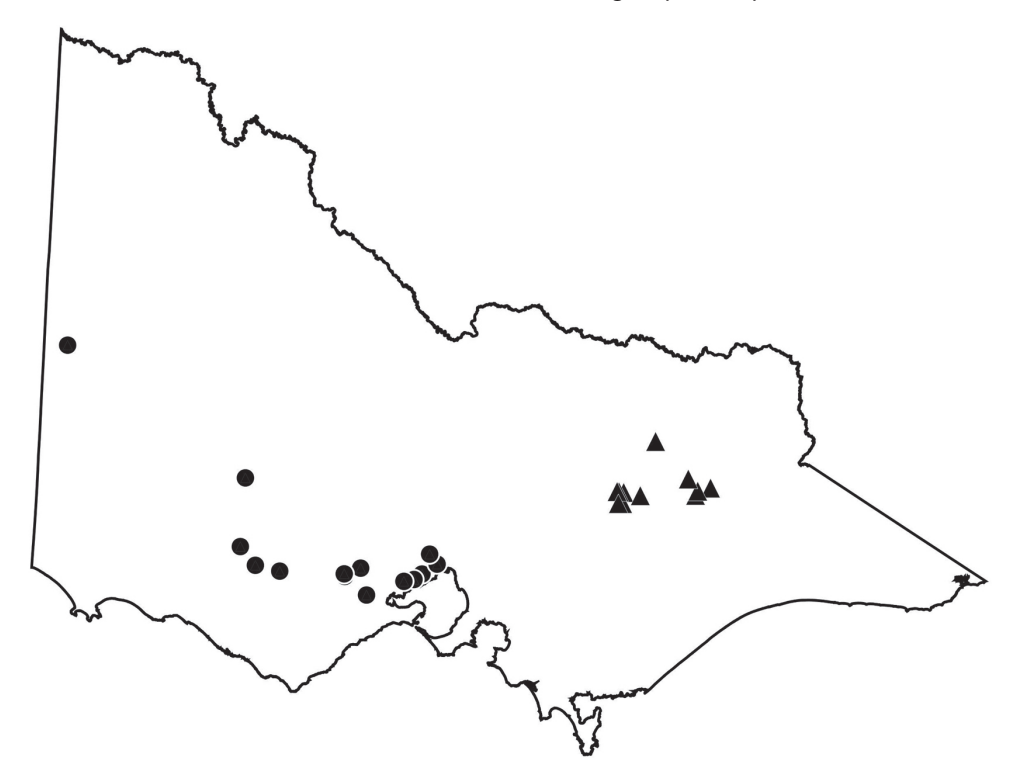
Figure 3. Distribution of Craspedia sylvestris (triangles) and C. basaltica (closed circles), based on herbarium collections at MEL.

Rosetted perennial herb, shortly rhizomatous; flowering scapes 1–4 per rosette, to 20(–30) cm high;