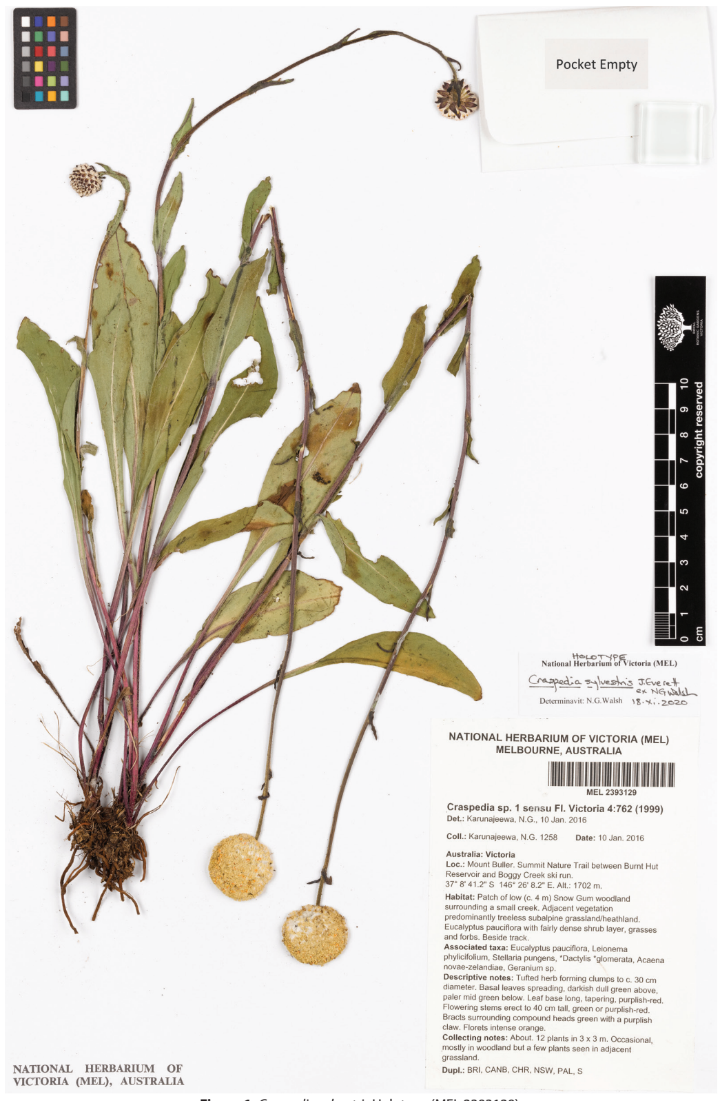
Figure 1. Craspedia sylvestris Holotype (MEL 2393129).