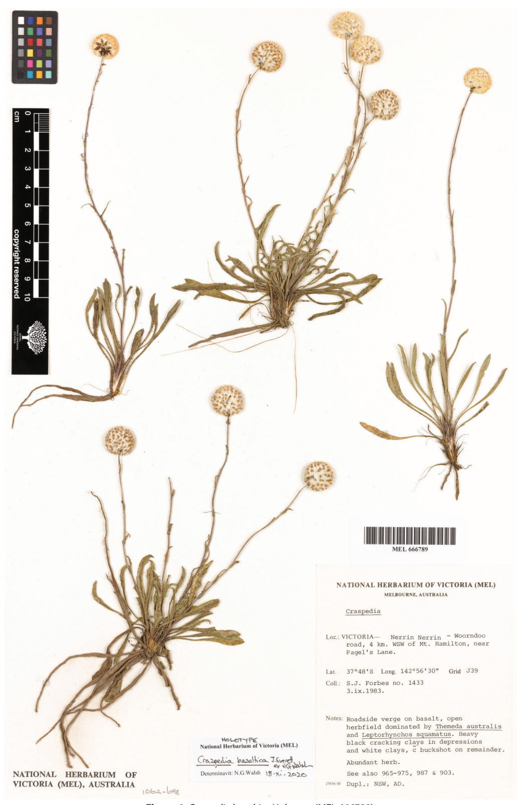
Figure 4. Craspedia basaltica Holotype (MEL 666789).