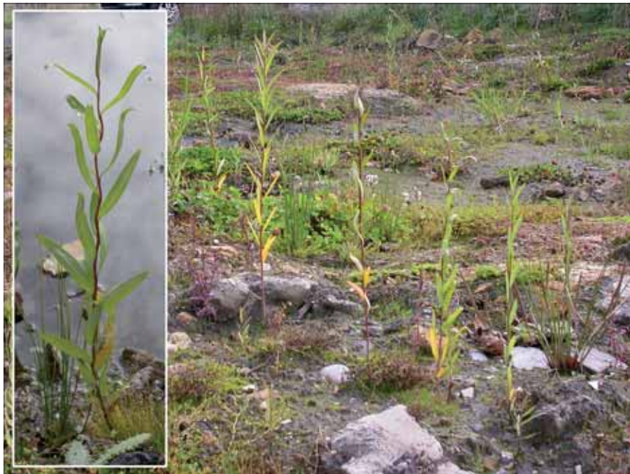
Figure 4. Saplings of S. matsudana 'Tortuosa' \times S. fragilis var. fragilis at a disturbed site in Huonville. Inset: Close-up of a single sapling showing contorted stem and leaves.

means (Carr 1996). In Tasmania, it is grown as roadside plantings, in parks and large gardens, and is often planted on the banks of watercourses and water bodies in rural areas. It is rarely recorded as naturalised, most plants appear to have been planted deliberately. At one location (Emu River, Burnie Baker 248 , HO), a small degree of vegetative spread, limited to a few plants, is evident but deliberate planting still cannot be ruled out. This taxon is capable of sexual reproduction, a population of small saplings were growing in a roadside drainage line in southern Tasmania (Lucaston, Baker 1745 , HO). The plants had characteristic yellow stems of S. xsepulcralis nothovar. chrysocoma . Both S. fragilis var. fragilis and S. xsepulcralis nothovar. chrysocoma were in cultivation nearby. Salix xsepulcralis nothovar. chrysocoma may have also been a parent of an infestation of plants which grew in sediment settling ponds at Launceston.