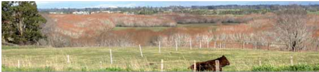
Figure 3. Salix fragilis var. fragilis growing on the floodplains and banks of the South Esk River at Longford.