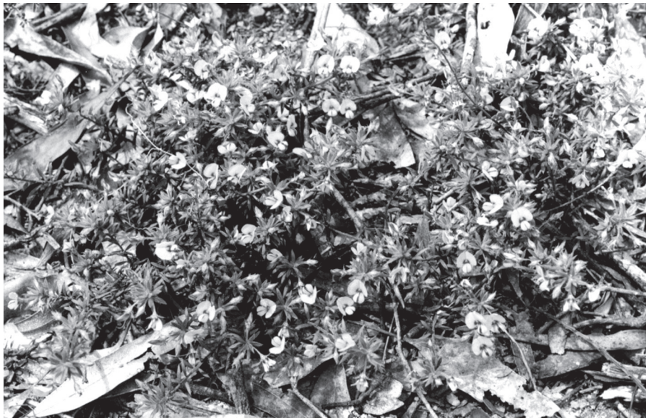
Figure 2. Habit photograph of Pultenaea dargilensis .

Distribution and habitat: Known only from the Dargile Forest, some of which is now incorporated into the Heathcote-Graytown National Park. Grows in box-ironbark forest on clay-loam soils derived from Devonian sediments. Associated species include Eucalyptus microcarpa (Maiden) Maiden, E. tricarpa (L.A.S. Johnson) L.A.S. Johnson, Acacia pycnantha Benth., A. acinacea Lindl., Cassinia arcuata R.Br., Hibbertia exutiaces N.A. Wakef., Brachyloma daphnoides (Sm.) Benth., Arthropodium strictum R.Br., Dianella admixta Gand.