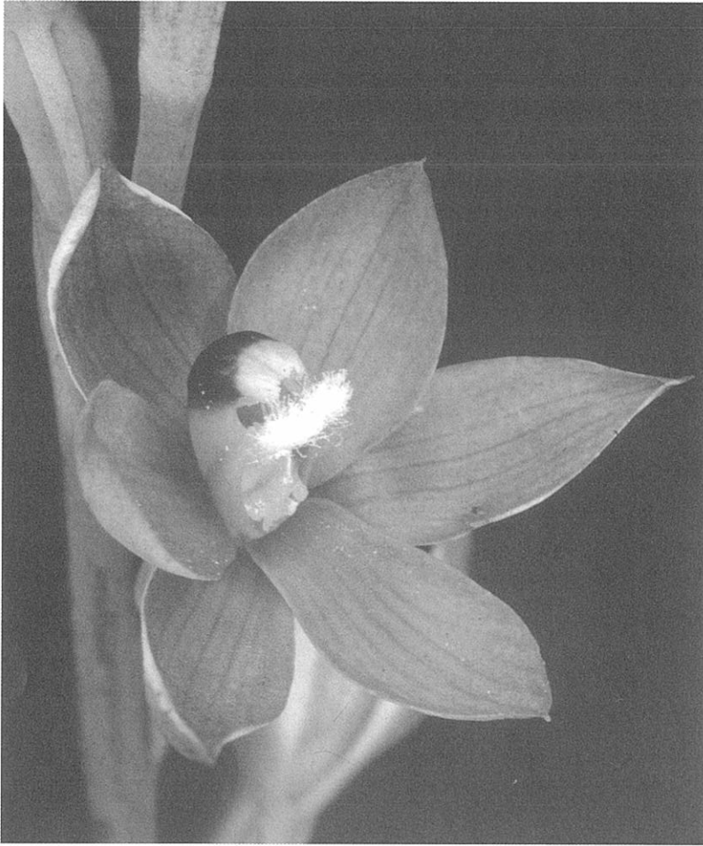
Figure 3. Thelymitra atronitida Mallacoota area