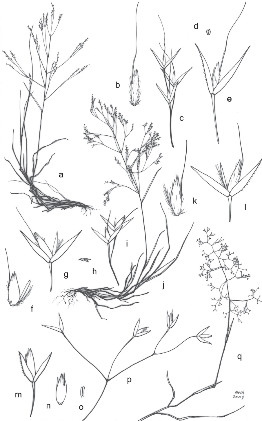
Figure 1. Probable parental and hybrid plants from Crawford River, Victoria. Lachnagrostis filiformis : a. part tussock \times 0.3 ; b. floret \times 10 ; c. spikelet cluster \times 5 ; d. anther \times 10 ; e. spikelet \times 10 . L. xripulae : f. floret \times 10 ; g. spikelet \times 10 ; h. shrivelled anther \times 10 ; i. spikelet cluster \times 5 ; j. part tussock \times 0.3 ; k. floret \times 10 ; l. spikelet \times 10 . L. rudis : m. spikelet \times 10 ; n. floret \times 10 ; o. anther \times 10 ; p. spikelet cluster \times 5 ; q. part tussock \times 0.3 ( a–e A.J. Brown 2414; f–i A.J. Brown 2419; j. A.J. Brown 2415; k–l A.J. Brown 2416; m–q A. J. Brown 2412).