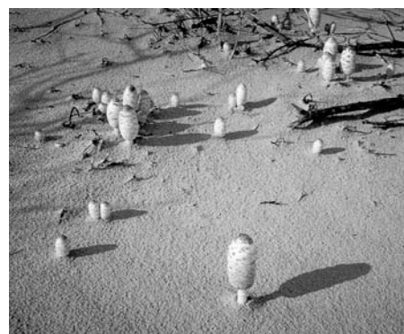
Coprinus comatus on the beach

New Fungimap member Phillip Dawson sent this enigmatic image of the Fungimap Target species Coprinus comatus , emerging from a sandy beach at Pieman Heads, west coast Tasmania. They are growing on logs that were felled upstream by piners in the 19th century, washed down by floodwaters sometime since and buried more than 60 cm in the beach sand!