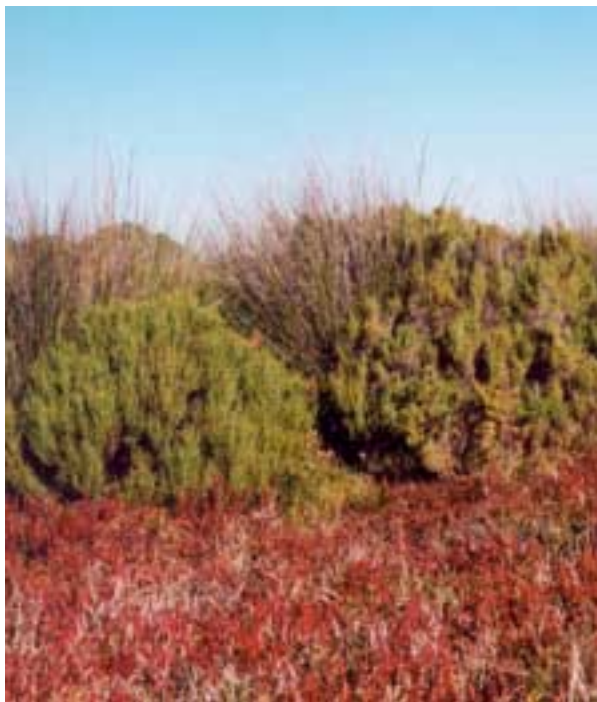
Above: Typical saltmarsh vegetation - a dense mat of Sarcocornia quinqueflora with scattered rushes and small shrubs.

It is hoped that this study will result in the development of an ecologically sound management strategy for the saltmarshes of Port Phillip Bay that maintains biodiversity by reducing the threats to these critical ecosystems.