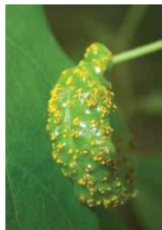
Myrtle rust on Eucalyptus regnans