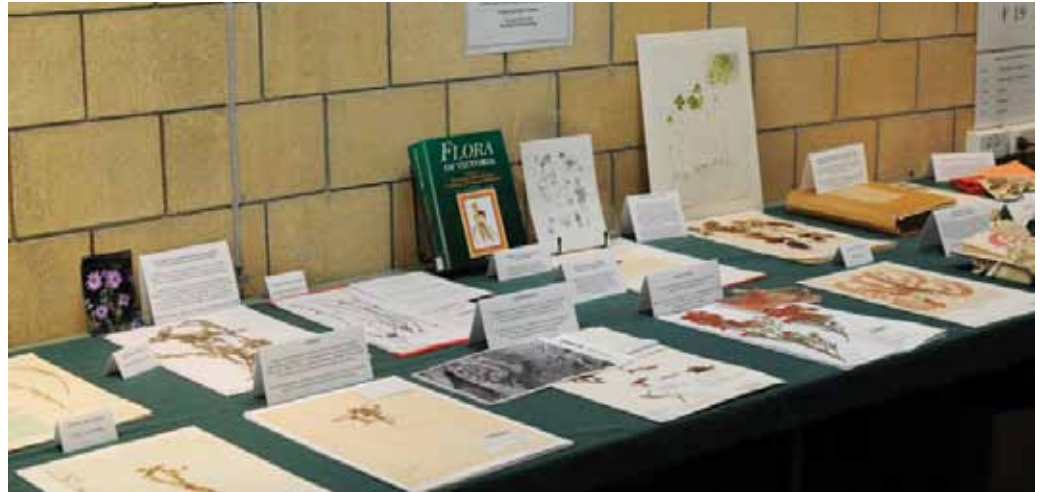
Specimens on display during a recent tour of the National Herbarium of Victoria.