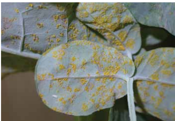
Myrtle Rust on Eucalyptus globulus. The infection is as a result of controlled environment testing