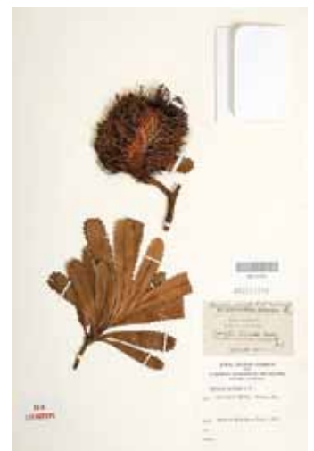
Banksia serrata (Saw Banksia) collected in 1770 by Banks and Solander, Botany Bay