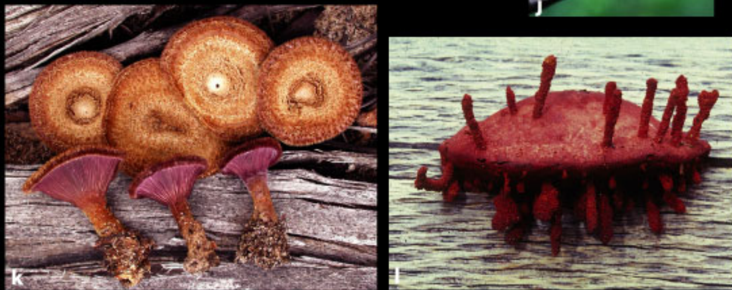
Plate 4. a. Entoloma sp. b. Nidula niveotomentosa ; c. Cyathus striatus ; d. Lysurus mokusin ; e. Cotylidia undulata ; f. Podoscypha petalodes ; g. Parasitised beetle ; h. Parasitised sphingid moth ; i. Parasitised wasp ; j. Parasitised fly ; k. Panus fasciatus ; l. Parasitised Pycnoporus.