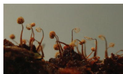
Cribraria splendens