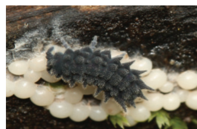
Collembolan Acanthanura sp. on Didymium sp. (S. Lloyd)