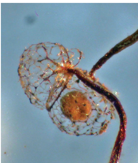
Cribraria splendens - peridial net with spore mass remnants x 40 (P. George)